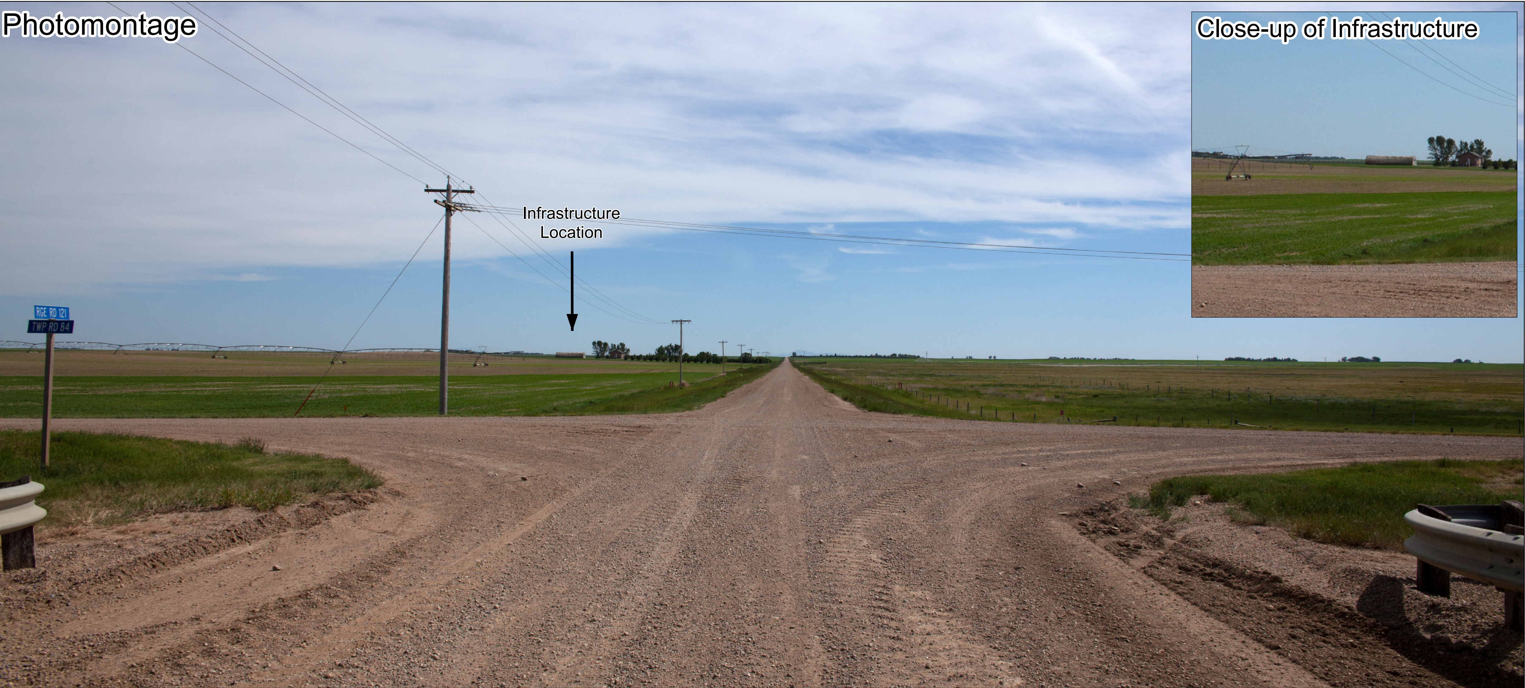
Close-up of Infrastructure