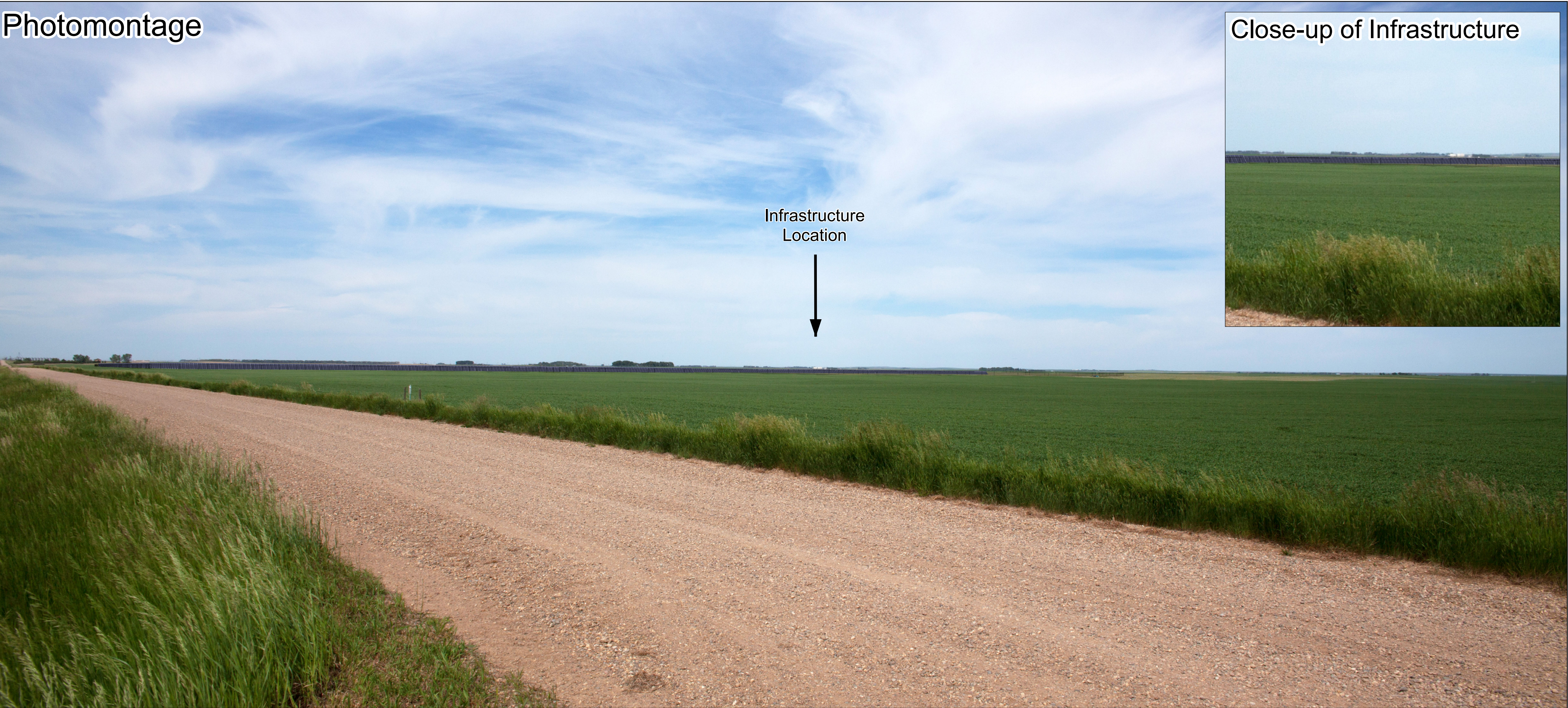
Close-up of Infrastructure