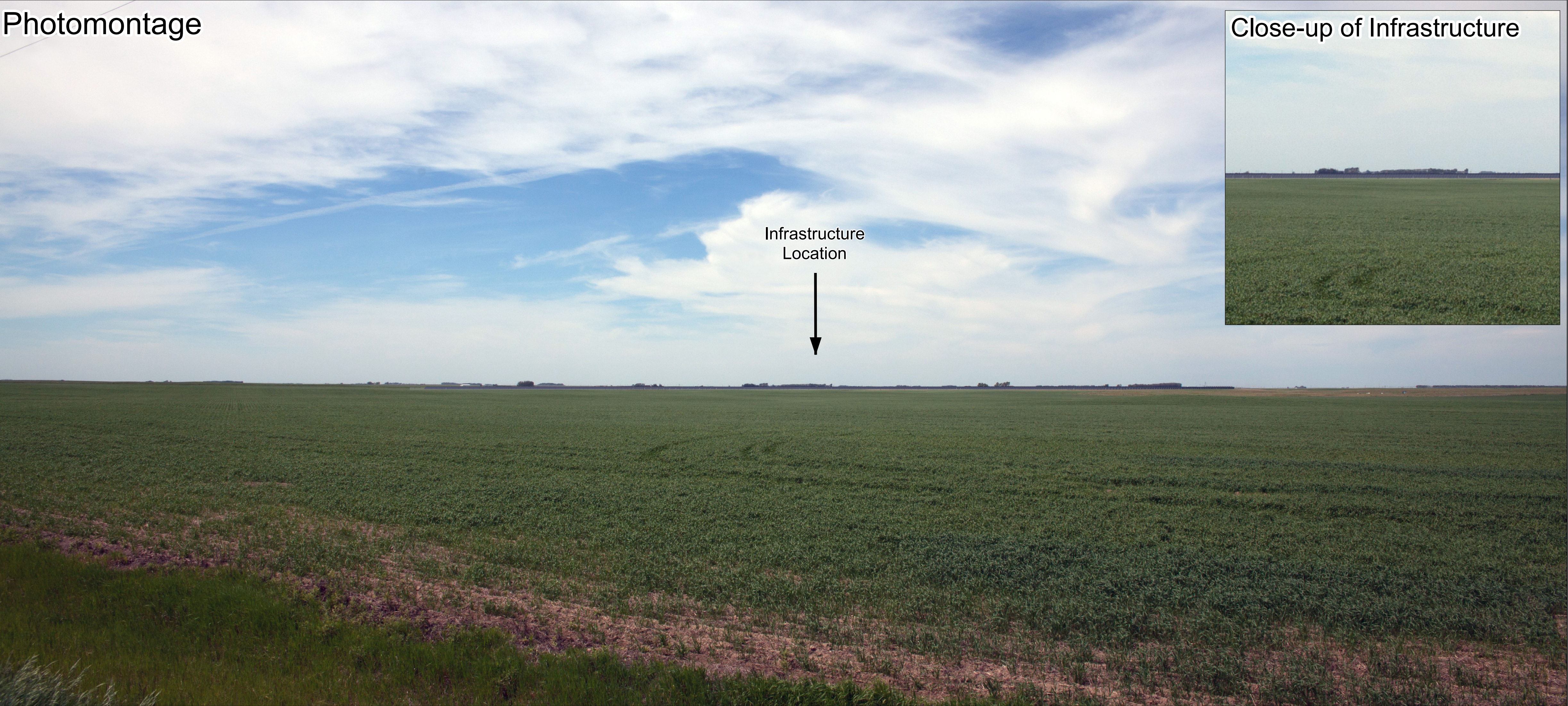
Close-up of Infrastructure