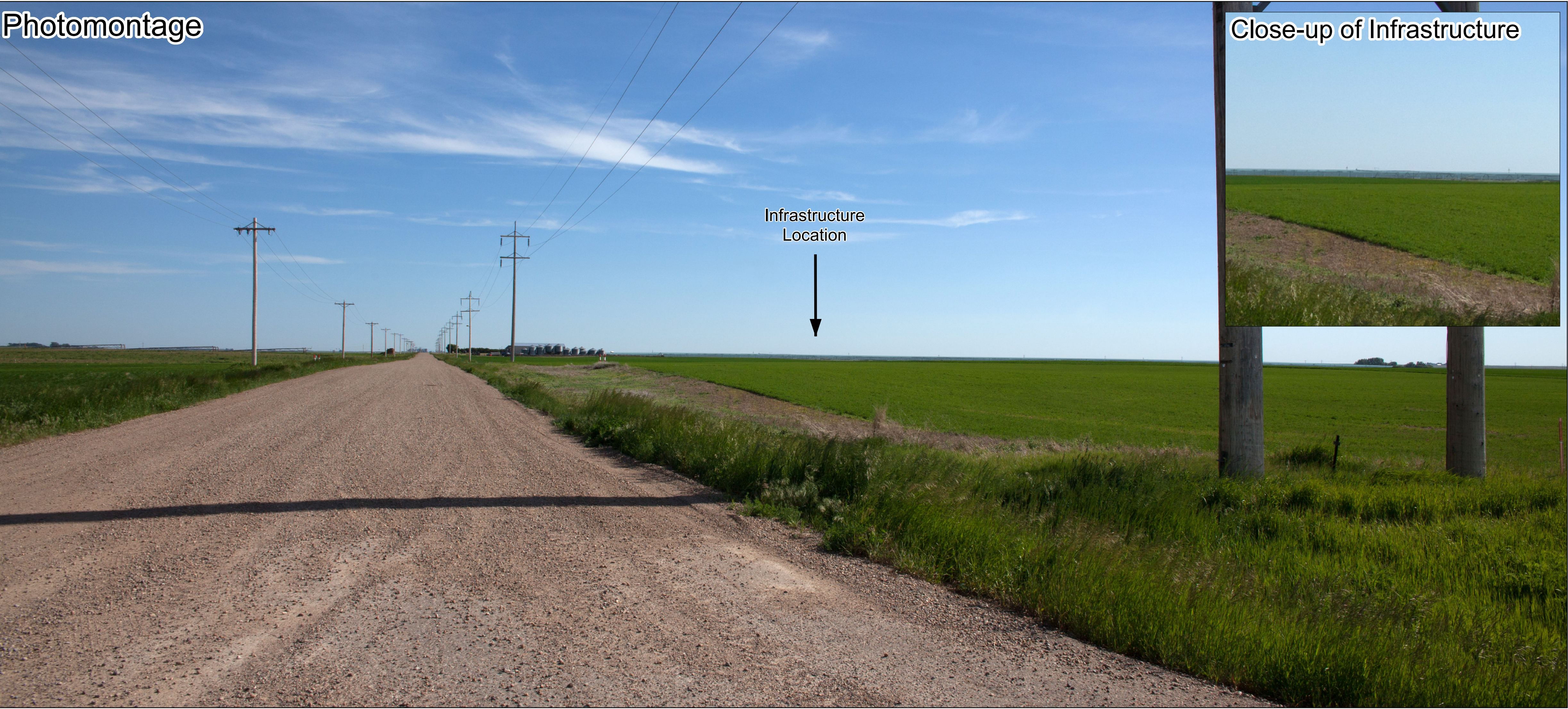
Close-up of Infrastructure