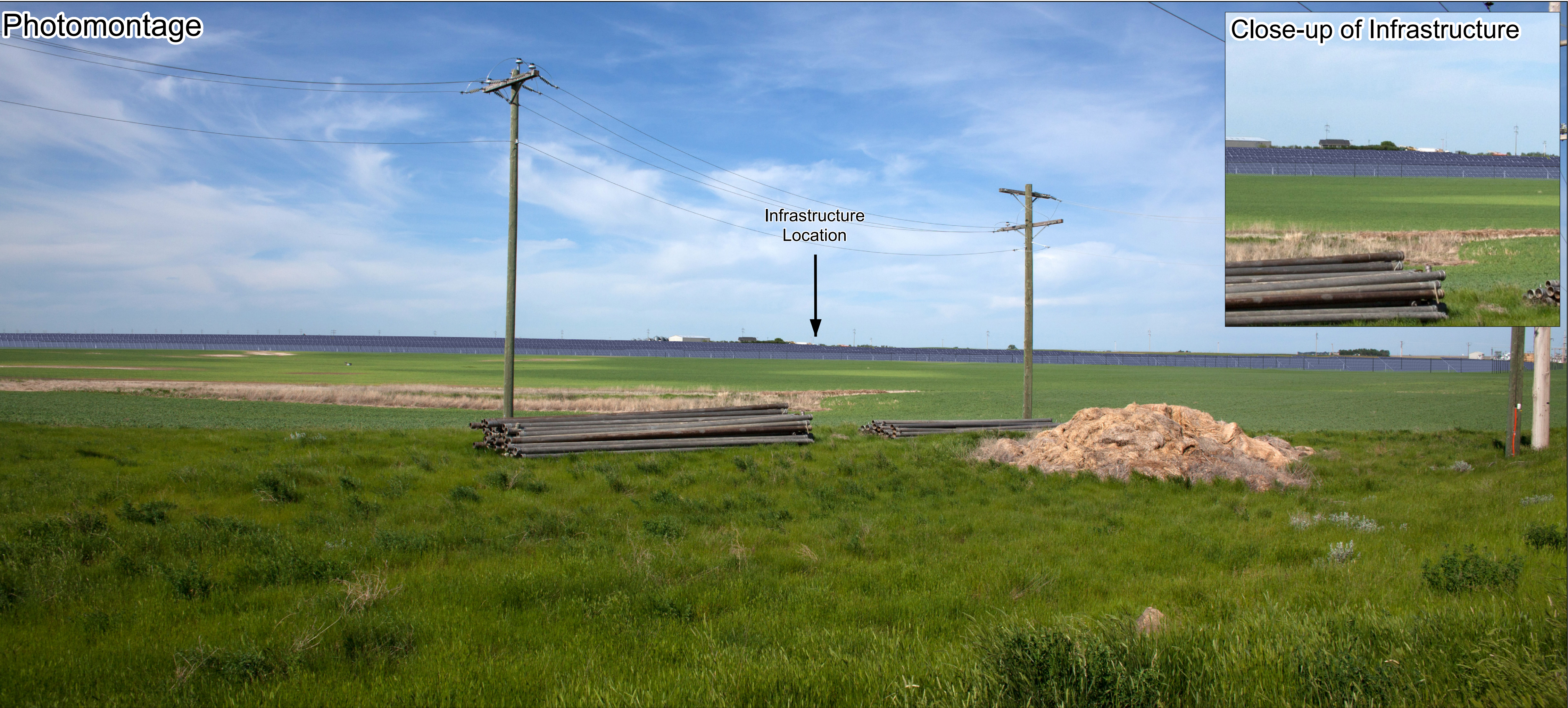
Close-up of Infrastructure